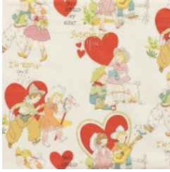
From Free Spirit: