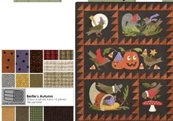
And from Checker:

Thread Heaven, scissors, thread, rulers, books, patterns, class supplies, Best Press, matts & cutters & blades, needles, thimbles--if you were waiting on an order, it probably is here. Give me a call.